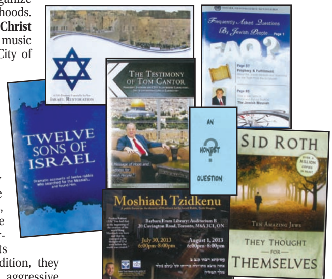
These missionary materials that target Jews for conversion were sent to Jewish homes in Toronto in Summer 2013.

For help to combat this unprecedented surge of missionary activity throughout the GTA, JEWS FOR JUDAISM urges the Jewish community to contact us at 416-789-0020 or visit us at www.jewsforjudaism.ca to receive our materials, free of charge, or arrange a free confidential discussion. ■